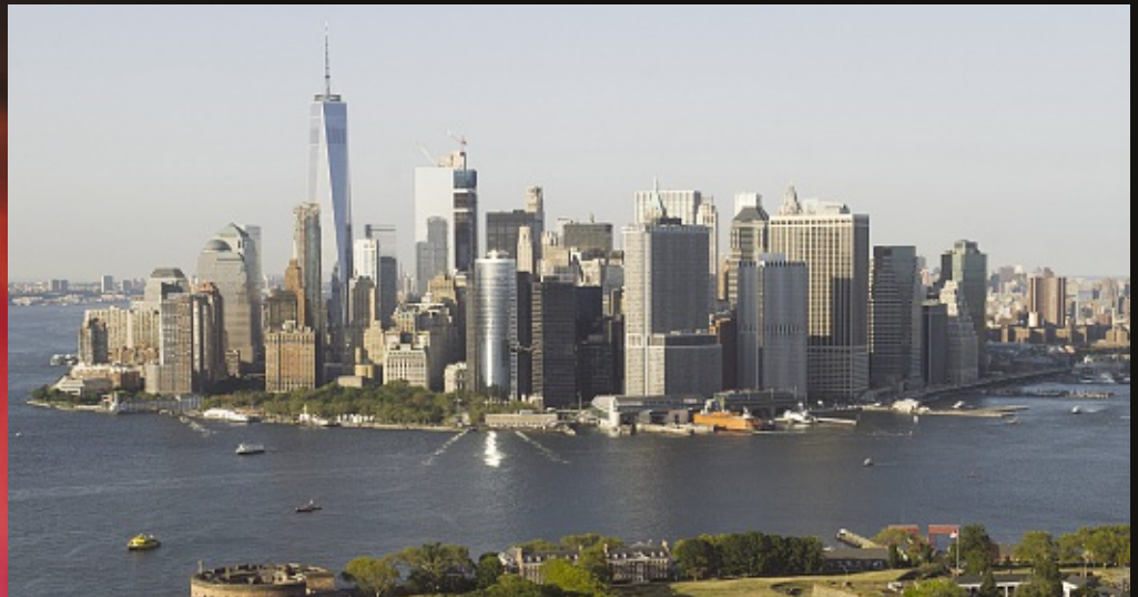
Top of the heap: New York attracted the most FDI projects between 2012 and 2016, and boasts the highest GDP in the rankings

T he bright lights of New York have again outshone every other city on either American continent. The metropolis attracted 819 FDI projects between 2012 and 2016 – the highest number of all locations in this study. Most investment in the city was derived from companies from western Europe (68.6%), followed by Asia-Pacific (14.8%) and North America (6.7%).