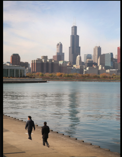
At the summit: Chicago wins the Major Cities FDI Strategy award

Note: List restricted due to shortage of suitable entries.